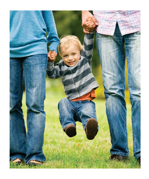
Materials developed by Nebraska Children and Families Foundation. NebraskaChildren.org

Contact your local Circle of Security Registered Parent Educator to learn more about Circle of Security™-Parenting classes in your area.